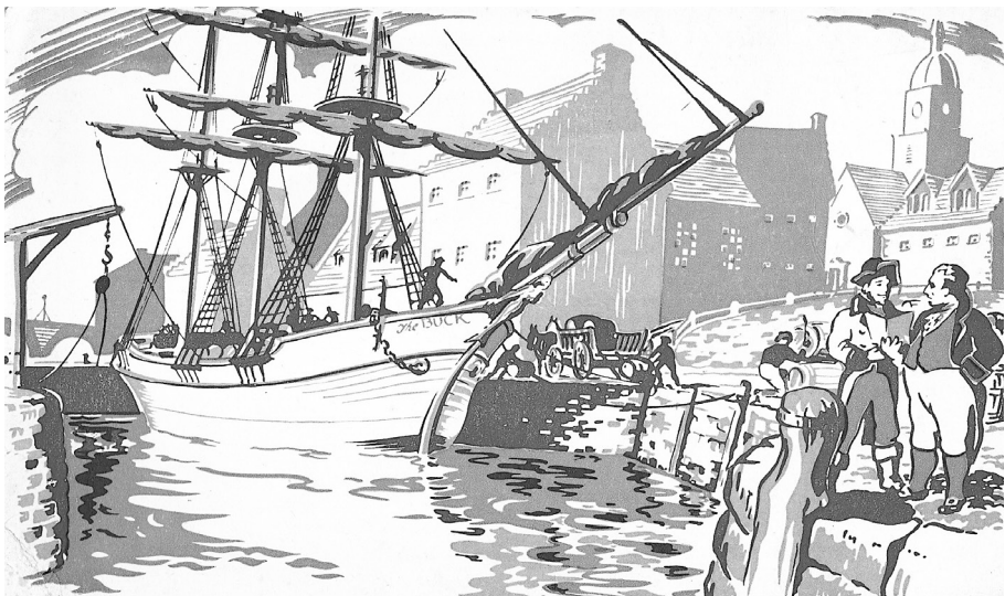
‘The Buck’, 1766

If we can help please do ask, we love to talk about wine.